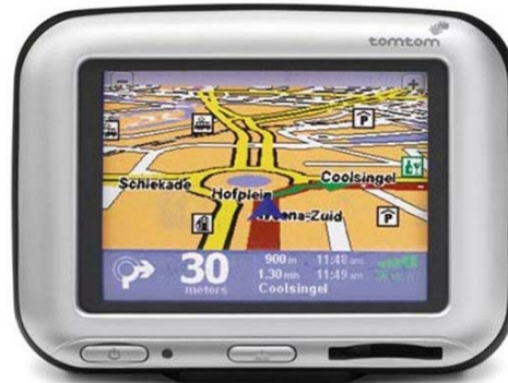
Figure 1: TomTom Navigator System

necessary for a proper visualization of the geo-referenced information on mobile devices [Krüger04].